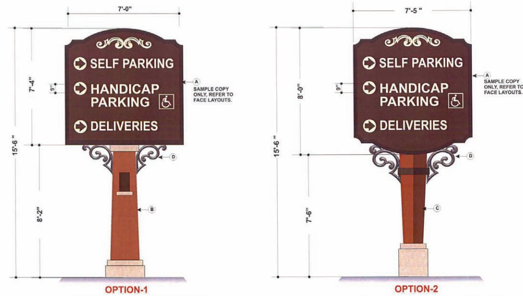
EXAMPLES OF PROPOSED ENTRYWAY DIRECTIONAL SIGNS (SCALE: 1"=6')